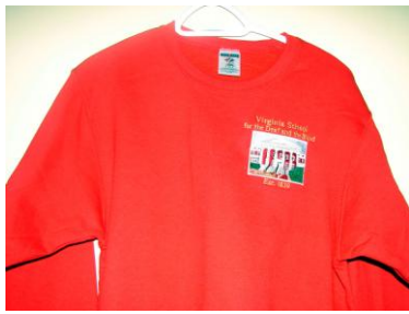
MODEL S SWEAT SHIRT Oxford (Light Gray) or Red or Black