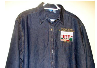
MODEL D DENIM SHIRT Dark Blue