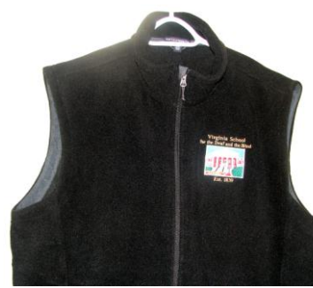
MODEL F FLEECE VEST Red or Black