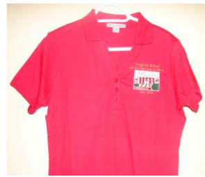
MODEL P POLO SHIRT (Red or Black)